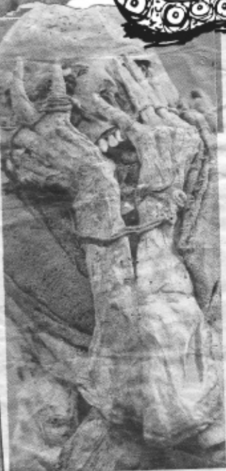
Exhibits: mummies found in rainforest of Peru

These mummies — which are nearly 1,000 years old — from the Chachapoyas culture are being displayed at the Museum of The Nation in Peru's capital Lima. Twelve, including a baby, were found deep in Peruvian rainforest.